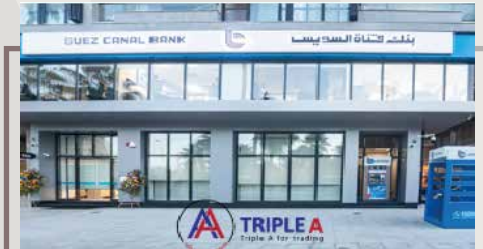
Suez Canal Bank