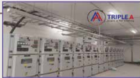
Construction of power and water stations – Cancer Hospital