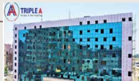
Tanta Cancer Center