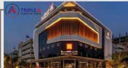
Banque du Caire