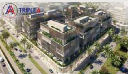
One 90 Mall