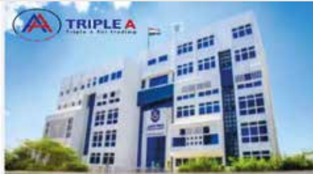
Damanhour University Hospital