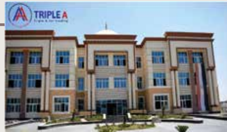
Beni-Suef National University