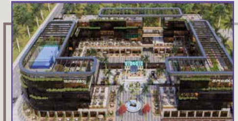
Golden Hub Mall