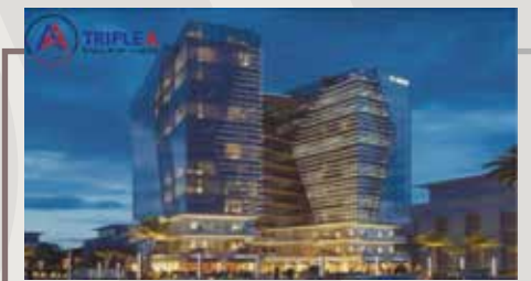
Mall S -One New Capital