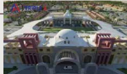
Murabet Equestrian City