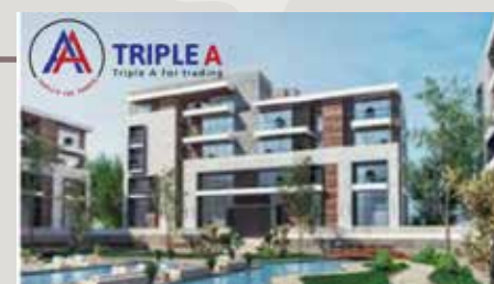
Compound Al Jazi Marriott New Cairo