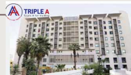
El-Demerdash Children's Hospital