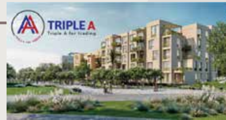
O West Orascom