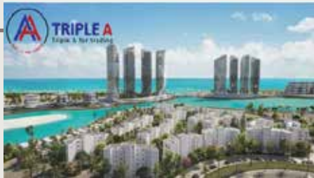
The Latin District New Alamein