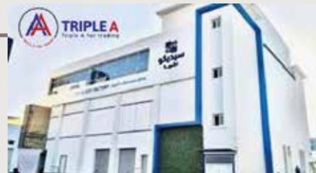
SEDICO Pharmaceutical Company