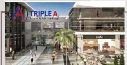
Agora Mall New Cairo