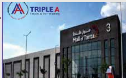
Mall of Tanata