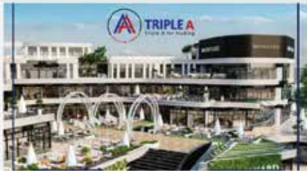
Moon Yard Al Shorouk City