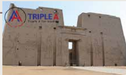
Temple of Edfu